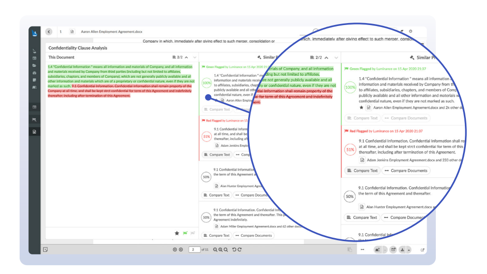
Red- and green-lining shows compliance and deviations from the 'model' clause

The team was particularly impressed by Luminance's language- and jurisdiction-agnostic capabilities, allowing them to work seamlessly across English, Spanish and Portuguese documents. For instance, after the team tagged just one example of a 'Proveedor' (provider) party in Spanish, Luminance's supervised machine learning instantly exposed five similar examples across the dataset.